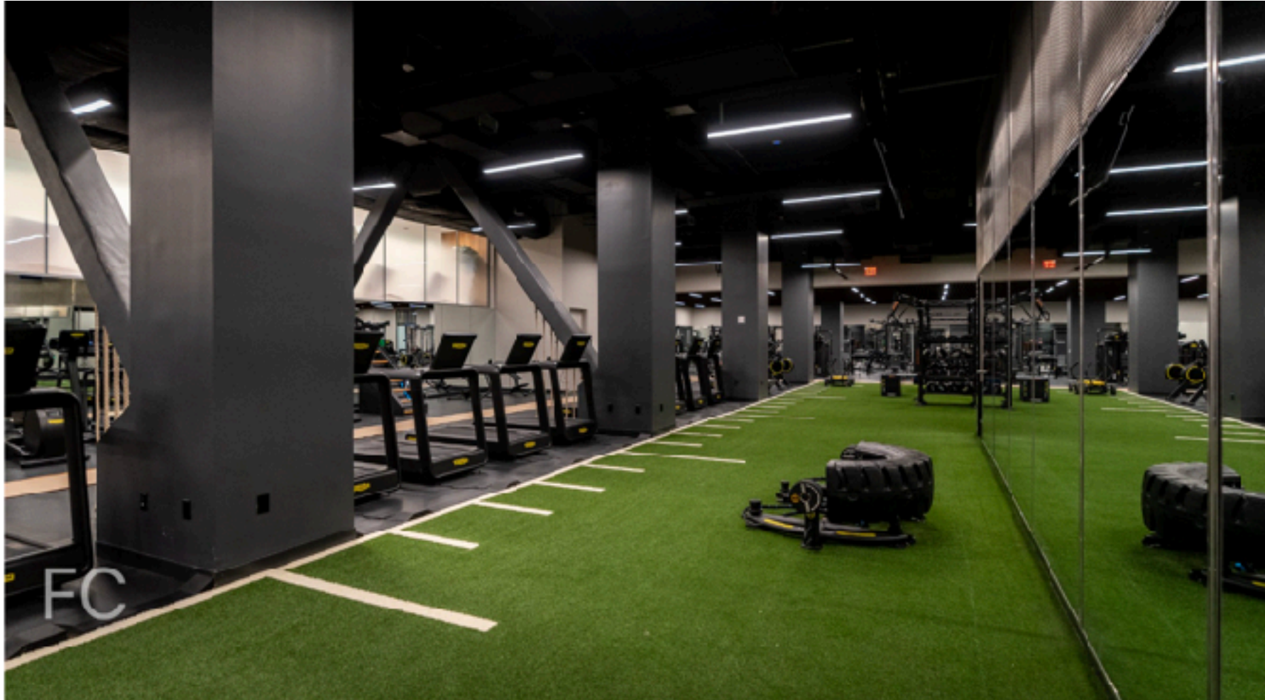
Fitness Center in the SoMA Athletic Club.

Spread out over 100,000 square feet, amenities will include spaces for entertainment and coworking, a basketball court, two indoor pickleball courts, fitness center, pilates and yoga studios, steam room and sauna, a 75 foot indoor swimming pool, an outdoor swimming pool on the 25th floor roof deck, a sports simulator, and an outdoor rooftop lounge with landscaped terrace.