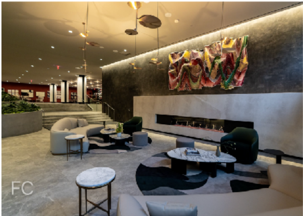
Residential lobby lounge.