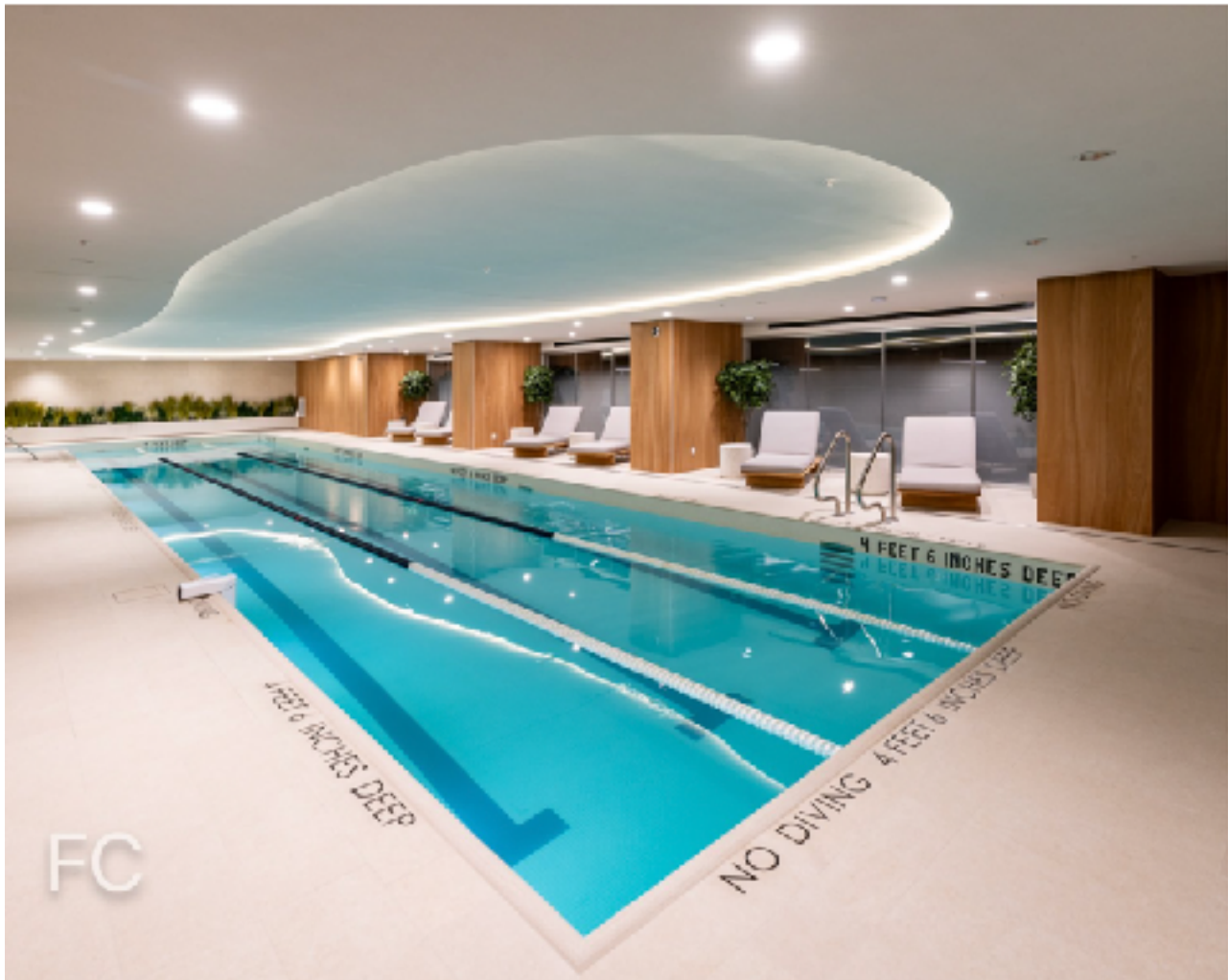
Indoor swimming pool.