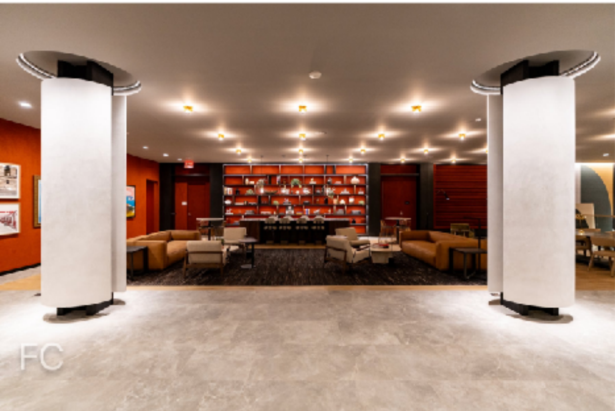
Residential lobby lounge.