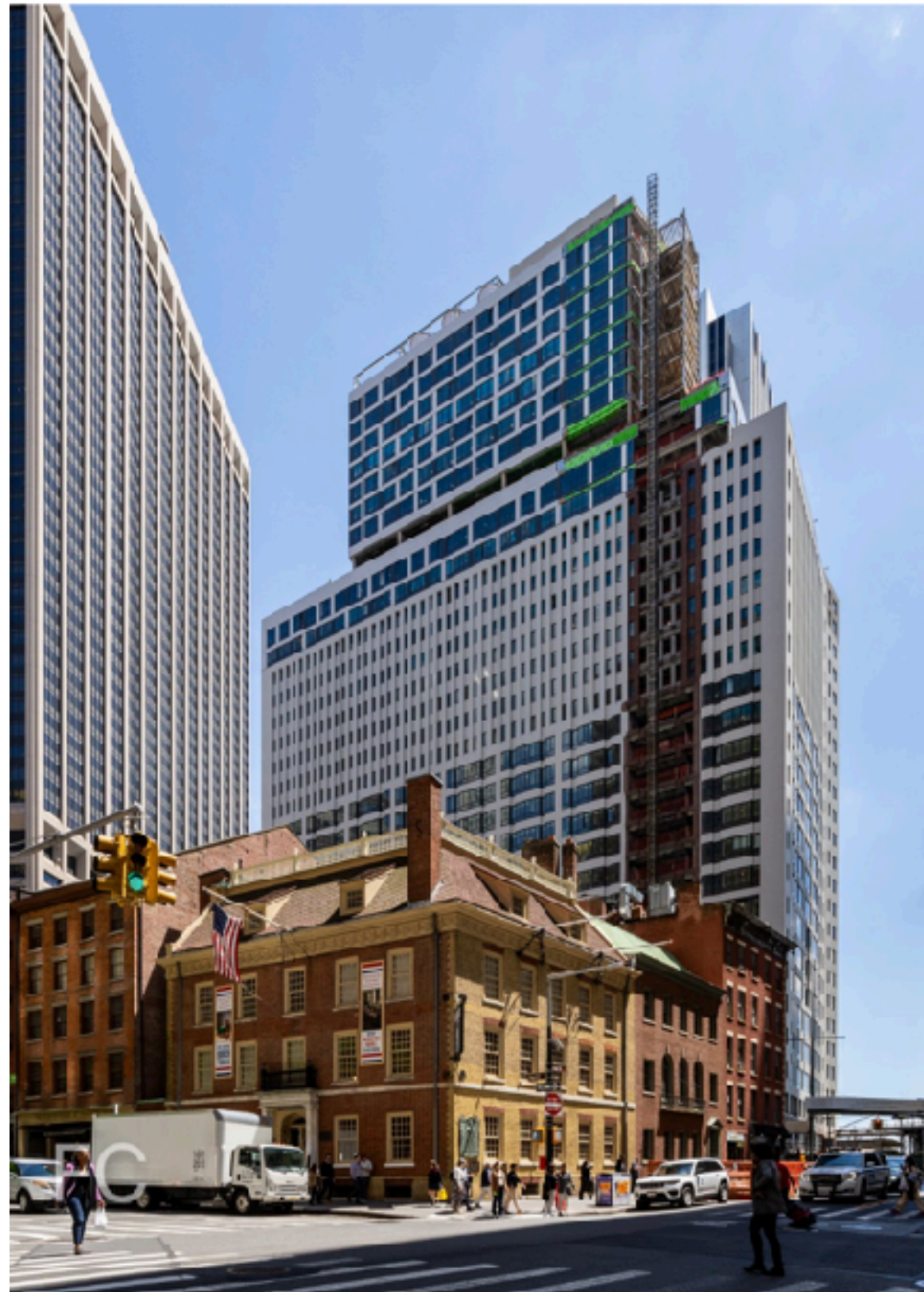
North facade from Broad Street.