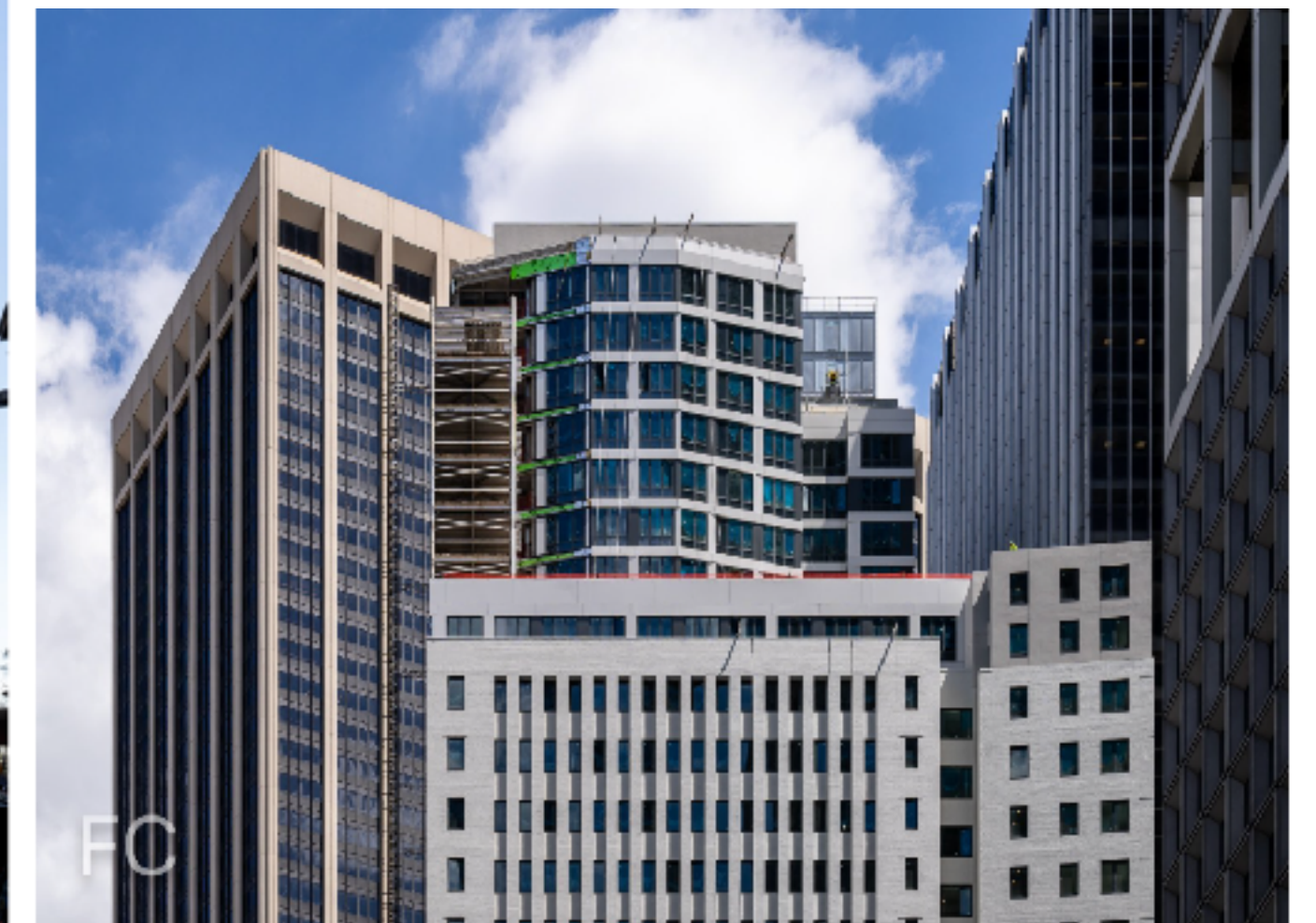
West facade from Water Street.

Construction is nearing completion at the office-to-residential conversion of 25 Water Street, a 1968 office and storage tower in the Financial District of Lower Manhattan by developers GFP Real Estate, Metro Loft, and Rockwood Capital. Designed by CetraRuddy Architects, will be the largest office-to-residential conversion by unit count, at over 1,300 residences, in US history. The project is also the first office-to-residential conversion to use New York's 467-m housing tax incentive, which provides a partial tax exemption for rental developments in converted buildings with the required amount of affordable housing. The conversion features an update to the existing 22-story brick-clad office building with large expanse of window wall replacing the narrow and irregular windows of the original tower's lower half. Along with the window replacement, the facade has also undergone a color change with the repainting of the deep red brick to white. The development also includes an additional steel-framed 10-story overbuild, including nine floors of residences and a full floor of amenities.