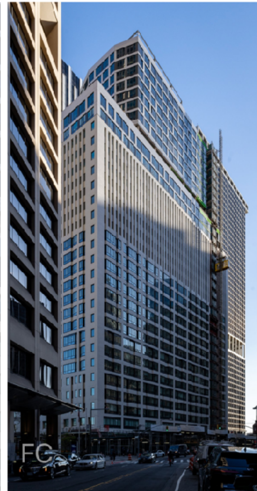
10-story overbuild at the tower crown.