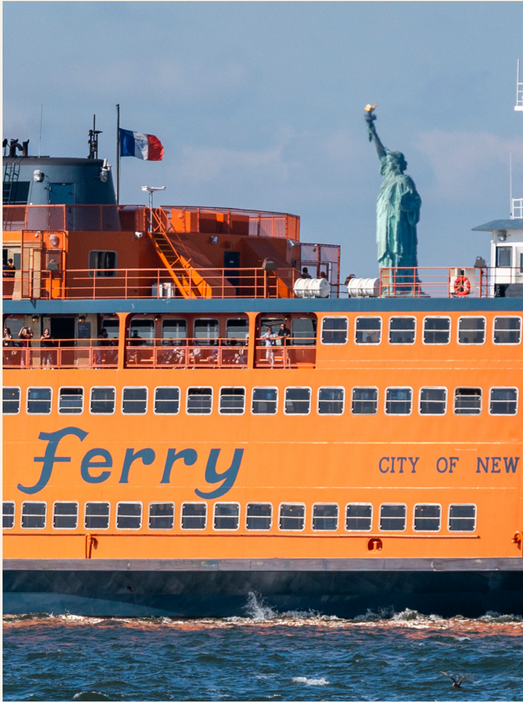
From ferry rides and water taxis to outdoor dining and concerts, the piers neighboring SoMA provide transportation and entertainment.